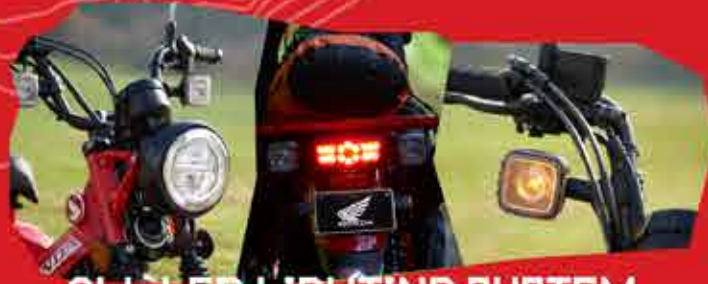
ALL LED LIGHTING SYSTEM WITH ICONIC DESIGN