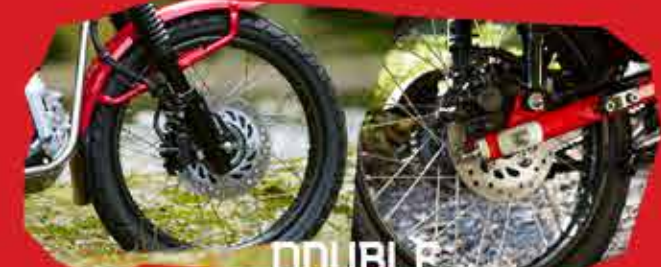
DOUBLE DISC BRAKE