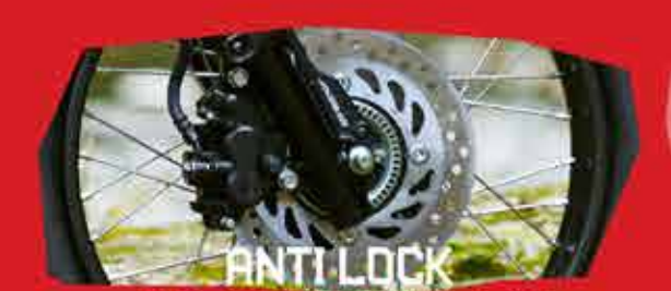
ANTI-LOCK BREAKING SYSTEM