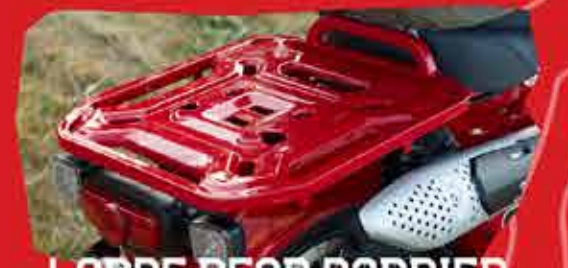
LARGE REAR CARRIER